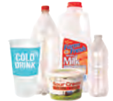
Plastic Bottles, Cups & Containers